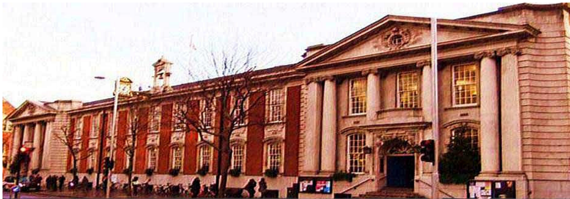
The Chelsea Old Town Hall, the location for the London Biennale 2013